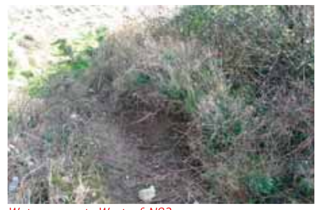
Watercourse to West of N82