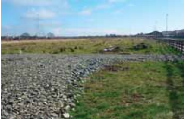
Fortunestown Lane (Section C) from West