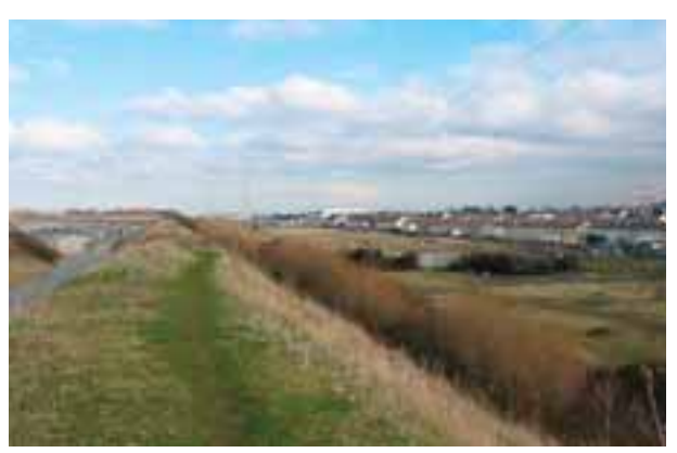
View of Section A from West

Another watercourse which feeds the River Camac is located in Section C; this is visible as an overgrown ditch and bank, the dimensions of which could not be ascertained. Section C is predominately rough pasture with the exception of a number of structures, noted below, and an area of hardcore at the Saggart terminus of the proposed route.